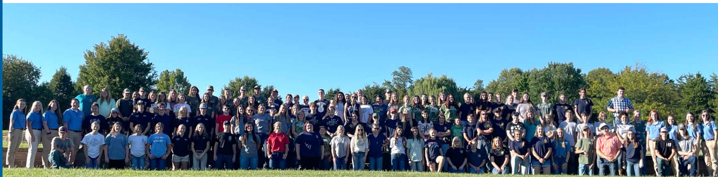
Members from across the South Ridge Area gathered in Bedford for the annual COLT conference.