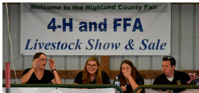
The sheep dressed up as an Oreo stole the show with first place in the Highland County Sheep Costume Contest!

No matter whether you attend the county fair of the large county of Rockingham or the least populated county of Highland, you will find some amazing foods that reflect the county’s traditions, fun rides, and activities, and, of course, a dose of agriculture and livestock from the student shows and sales. These fairs help to bridge the gap between agriculture students, the agricultural industry, and community members in a fun and exciting way. Be sure to visit your local county fair as well as the many others offered around the state!