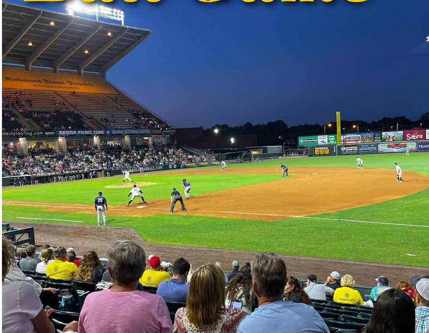
The Evening View of the Richmond Flying Squirrels Baseball Stadium.