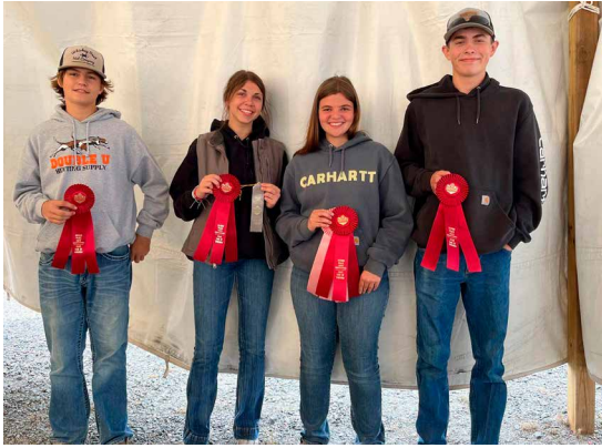
The second-place team in the Crops Judging Senior Division was from Nelson County!