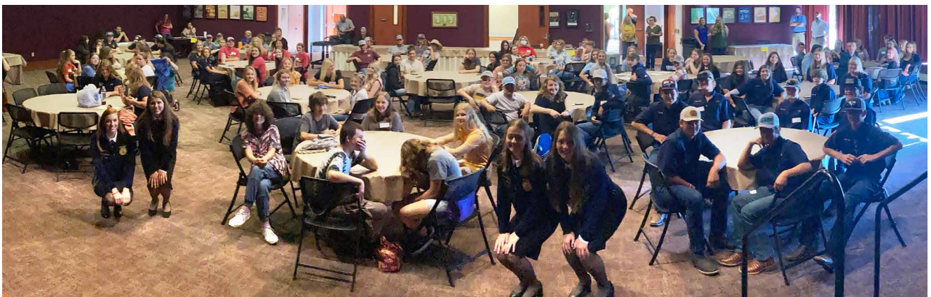
State officers pause for a photo with members from the Appalachian Area in Big Stone Gap, Virginia.