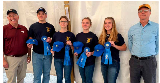
Congratulations to the State Champions in the Crops Judging Senior Division from Randolph Henry!