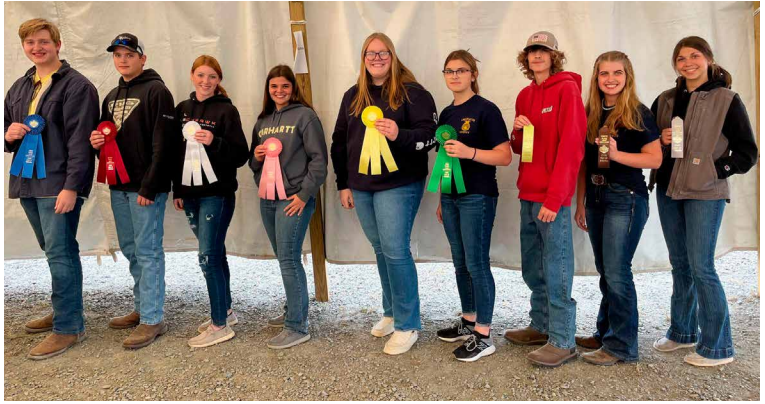
The top nine individuals from the senior division of the State Fair Crops Judging contest did an amazing job!