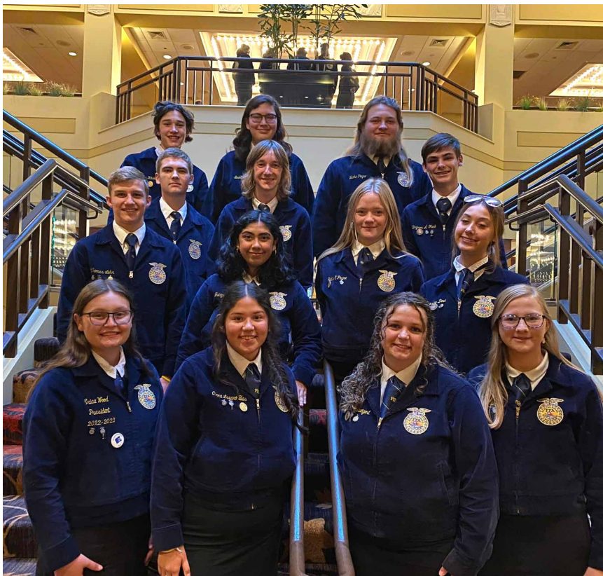
Broadway FFA members after the awards banquet at The Big E!

At the fair, there were also opportunities to try new foods, like dill pickle pizza, cream puffs, the Craz-E burger, and clam