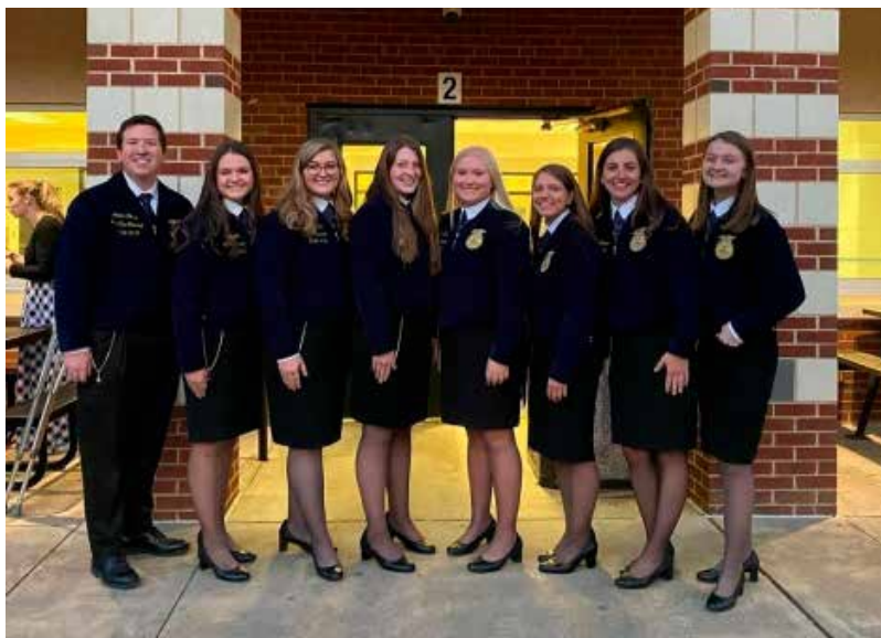
The VA FFA 2022-2023 State Officer Team.